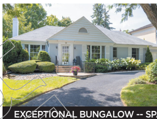
EXCEPTIONAL BUNGALOW -- SPACE -- GRACE -- ULTIMATE PRIVACY

$5,195,000. Exceptional Opportunity On Rochester * Handsome Much Admired Custom Build * Sensational Plan * Sun Filled * 9' Ceilings * 4 t Bdrms & Office * South Facing Lush Garden W/Pool * WALK TO YONGE! Kelly Fulton*